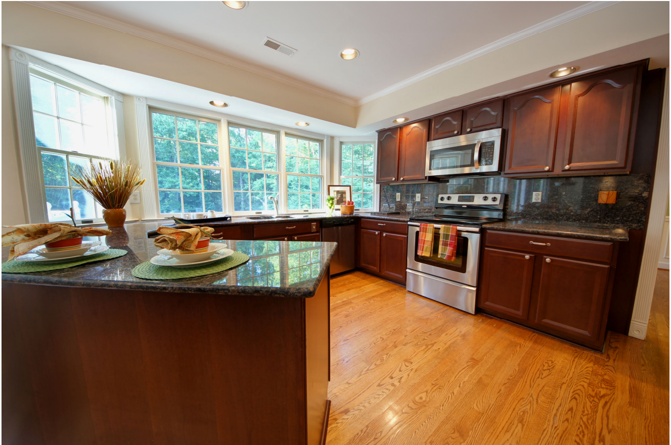
Kitchen with granite countertops, stainless steel appliances & new cabinets.