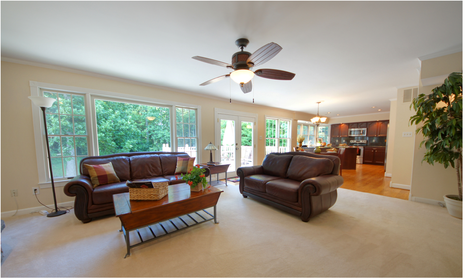
⇒ Family Room features new carpet, custom brick fireplace, recessed lighting and ceiling fan